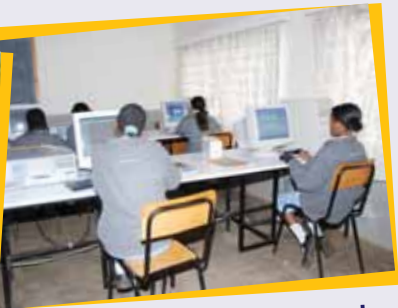
• Computer Labs