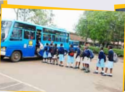
• Community Service