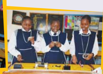
• Pure Sciences